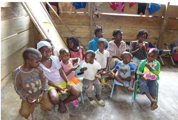
05-08) Material Cleptic Orphanage, 100.000cfa = €152,67