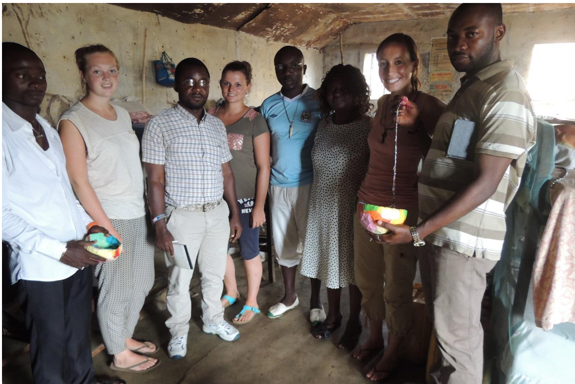
Because of privacy and unclosed cases we are not able to publish pictures of the prison project.