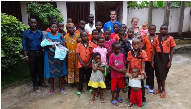
22-09) Material Delegate Orphanage, 100.000cfa = €152,67