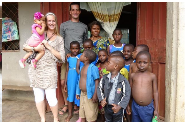
07-09) Material Frathekk Orphanage 50.000cfa = € 76,34