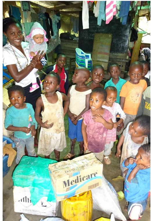
30-07) Material Mah Di's Orphanage, 100.000cfa = €152,67